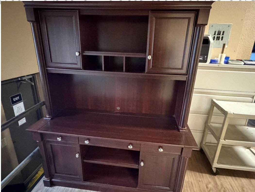
Credenza with Hutch