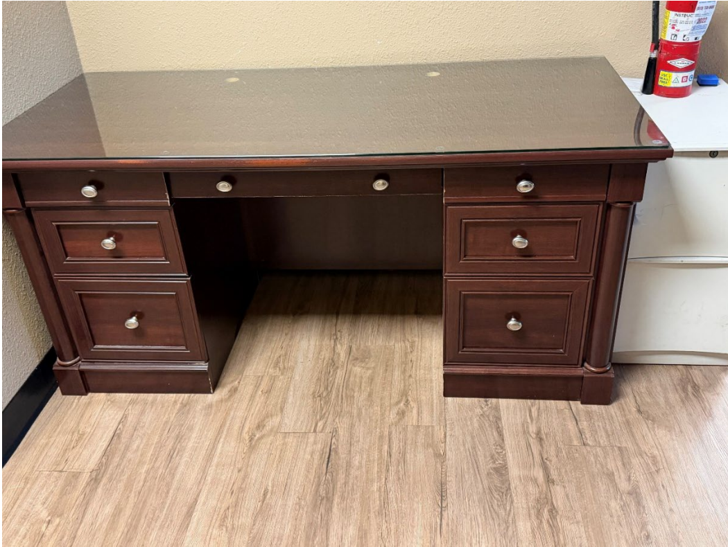
DRAFT COPY - FOR REVIEW ONLY Desk